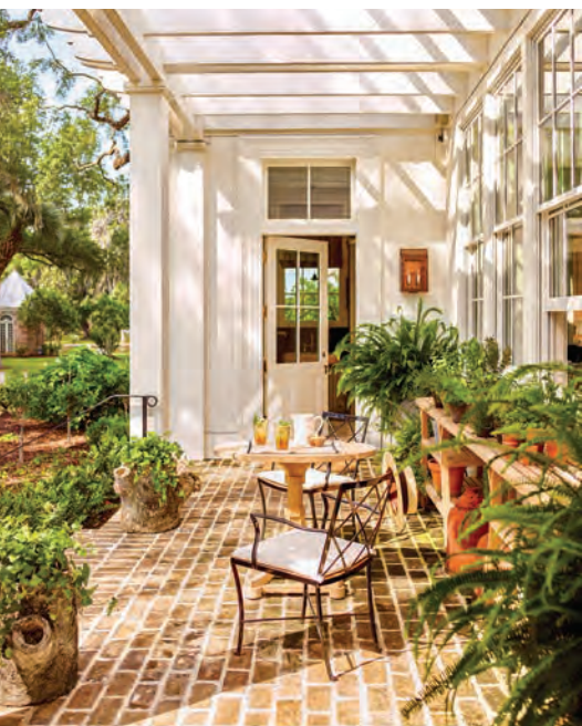
With its breezy, sunlit area capped with elegant architecture that helps it feel like a genuine room, a pergola-covered patio (crossbeams and an open lattice attached to the side of the home) provides the ideal setting for indoor-outdoor living.

The same soulful touches can also be found in the numerous well-appointed antiques Barbara introduced throughout. That one-two punch of patinaed architecture and design makes for a house brimming with new “old” style. Read on for ways to bring that best-of-both-worlds approach to your own home sweet home, no matter where you live.