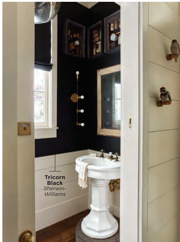
Tricorn Black Sherwin-Williams

▲ The main bath's sprawling dimensions are a thoroughly modern indulgence, but the room retains a level of historical integrity with classic finishes such as marble hexagon tiles, nickel plumbing fixtures, and a stand-alone soaking tub. ▼ The powder room evokes an apothecary vibe with inky black walls and a gallery of shadowboxes displaying vintage shaving items. When the antique sink purchased for the space proved too short, Barbara mounted it atop an old millstone found on the property.